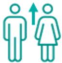
Number of jobs supported

The Fund's objective is to achieve long term capital growth with Impact. To achieve this, the strategy of the Fund is to invest in a diversified portfolio of both existing and new loans alongside FMO, the Dutch entrepreneurial development bank. The Fund therefore benefits from the long-standing expertise of FMO on impact investing in emerging markets and its established ESG research and impact measurement processes. Impact achieved by the fund is measured according to the impact methodology as adopted by FMO and reported through impact indicators on portfolio level and sector specific indicators. This includes the indicators below. An assessment or measurement of impact is often qualitative and subjective in nature and FMO, and therefore the Fund, must rely in part on information provided by its investees.